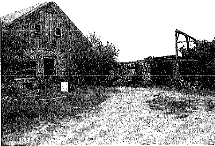
30. Largest existing barn (left), ruins of smaller barn (center)

Site No. 24-01 Sidwell No. 08-24-200-003