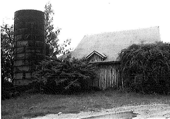
32. Largest existing barn (S view) and silo