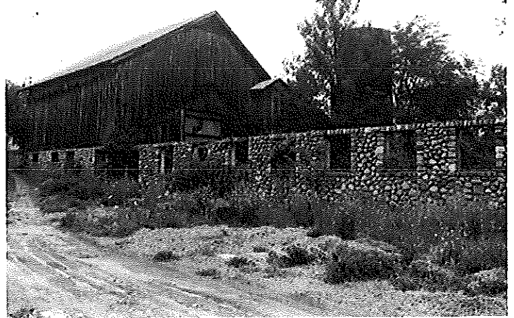
31. Largest existing barn (NW view), foundation ruins from another large barn