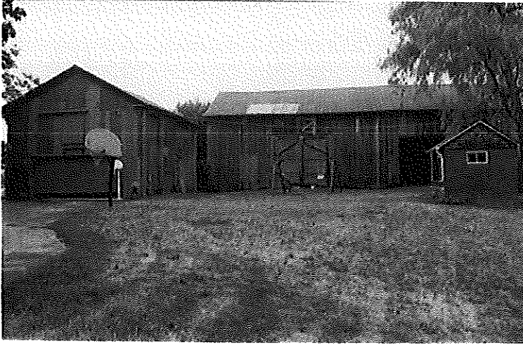
5. Two barns and small concrete block building (E)

Site No. 04-05 Sidwell No. 08-04-100-050