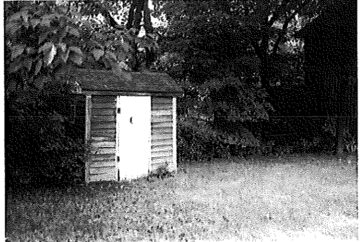
28. Outhouse & crib (in shadows)