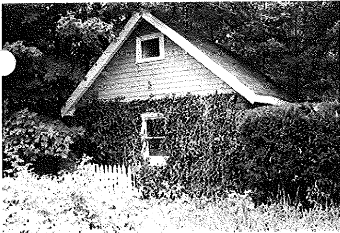
29. Well house (stone)