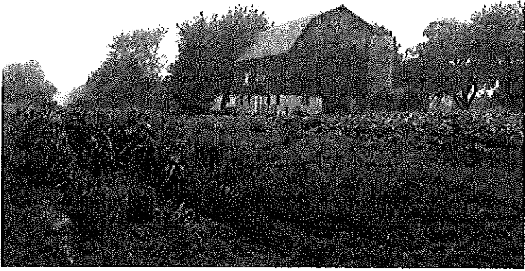
22. Barn, silo and small outbuilding

Site No. 15-03 Sidwell No. 08-15-476-005